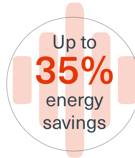
System efficiency improvement