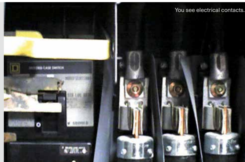
You see electrical contacts.

When it comes to predictive maintenance, thermography has become a preferred choice among building owners, managers and operating engineers. It's easy to understand why. With no downtime or interruptions required, instant imaging and picture perfect analysis, Trane Thermography is the ideal way to help keep your plant running safely and reliably.