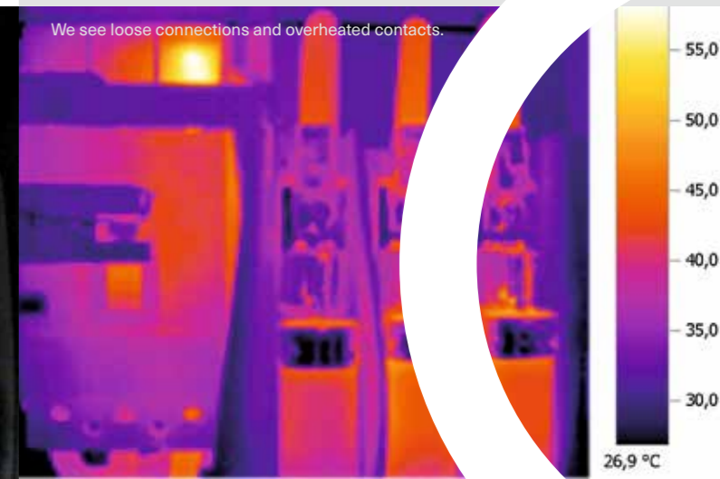
We see loose connections and overheated contacts.