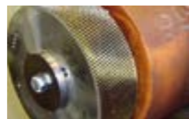
Compressor casing corrosion