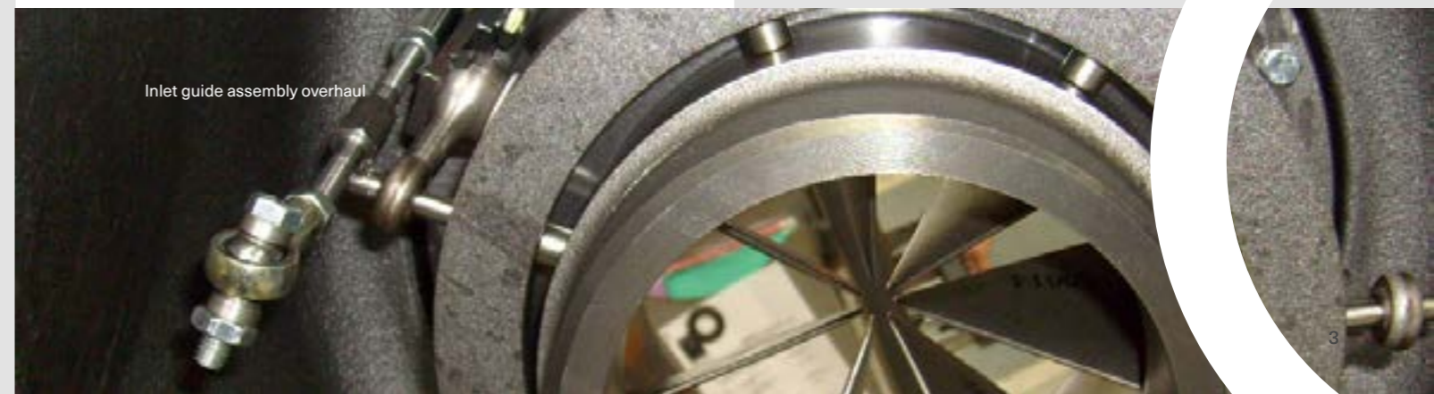
Inlet guide assembly overhaul