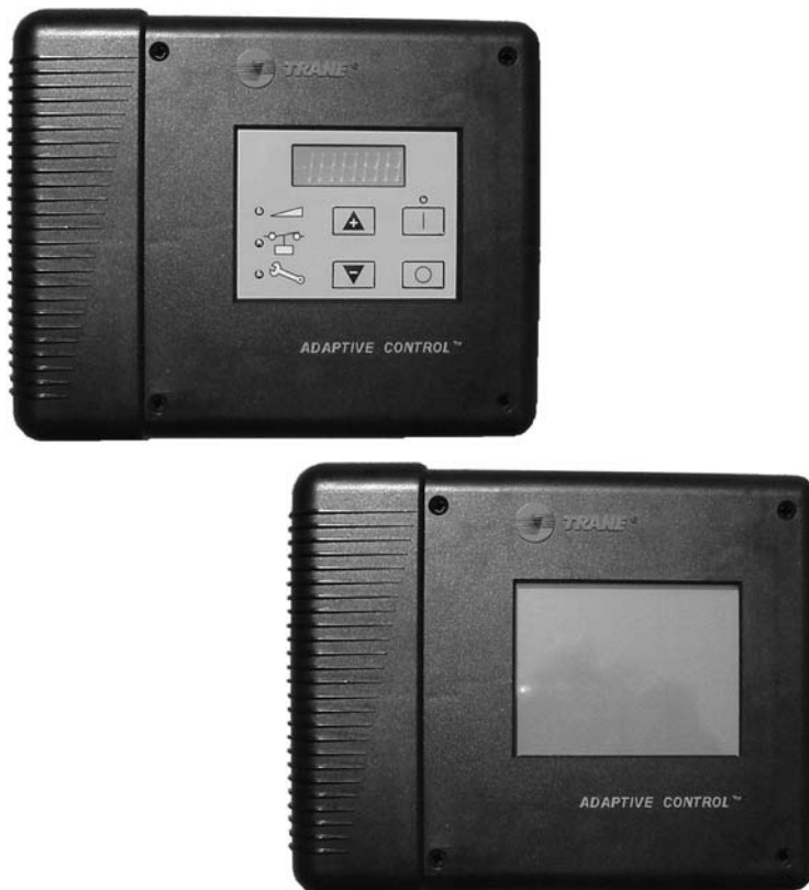
EasyView and DynaView Interfaces