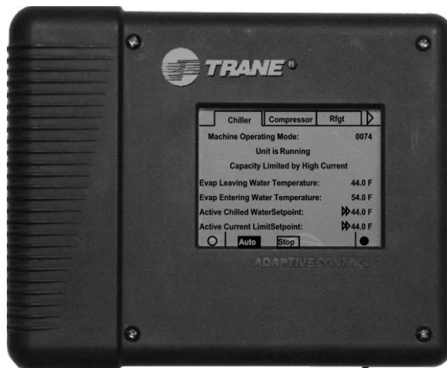
Figure 2 – DynaView Display

Radio buttons show one menu choice among two or more alternatives, all visible. (It is the AUTO button in Figure 2.) The radio-button model mimics the buttons used on old-fashioned radios to select stations. When one is pressed, the one that was previously pressed “pops out” and the new station is selected. In the DynaView model the possible selections are each associated with a button. The selected button is darkened, presented in reverse video to indicate it is the selected choice. The full range of possible choices, as well as the current choice, is always in view.