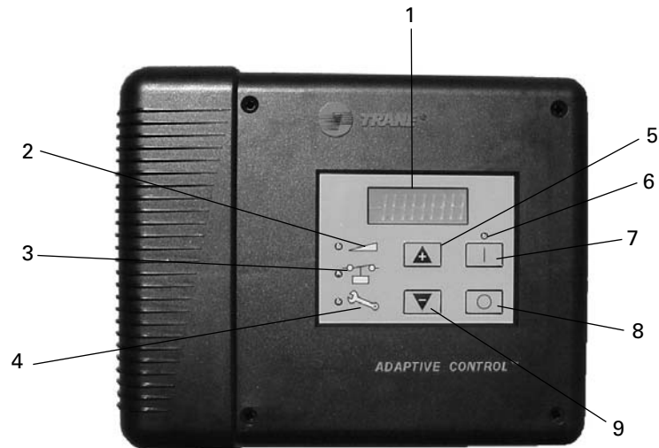
Figure 1 – EasyView Display