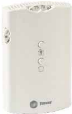
Figure 2 - TZS004 zone sensor

Every ReliaTel™ unit uses an RTRM. The RTRM provides primary unit control for heating and cooling. In addition, it has built-in logic that controls heating and cooling staging, minimum run times, diagnostics, heat pump defrost control, short cycle timing and more. It can be controlled directly by any of the following: