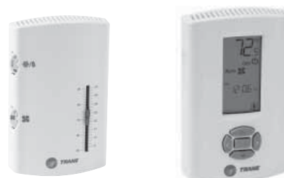
Table 17 - Characteristics of Programmable and Conventional Thermostats