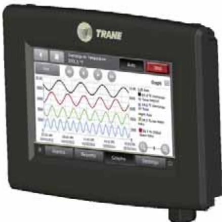
Figure 3 - TD5 user display

Graph data can be exported to an excel file through USB memory stick.