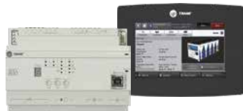
Tracer™ Symbio 800 and TD7 touch screen