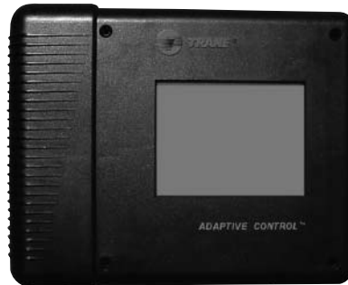
Figure 2 - DynaView operator interface